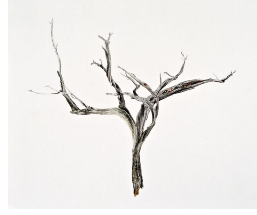
Artemisia tridentata 1, 2016

seeing was hard for me to grasp. Then, I was so taken by the twisted forms of juniper trees. On walks, I discovered that the dead branches of sagebrush took very similar forms. I collected branches and began painting them in watercolor: still life studies, without any background. I wanted the branches to appear to be specimens, like insects or birds, being recorded for posterity, the painting preserving a fragile object in time. The branches kept shedding little pieces while I worked, continually decaying.